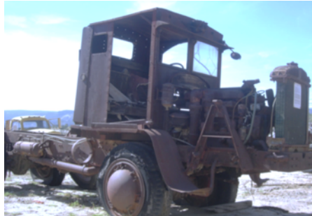
1930 Coleman showing the large dish-like hubcaps that house the front wheel drive